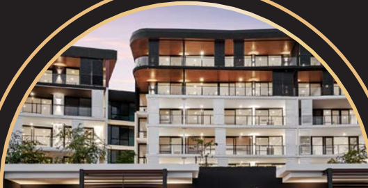
Apartments (Mid-Rise) East Village by Blackburne