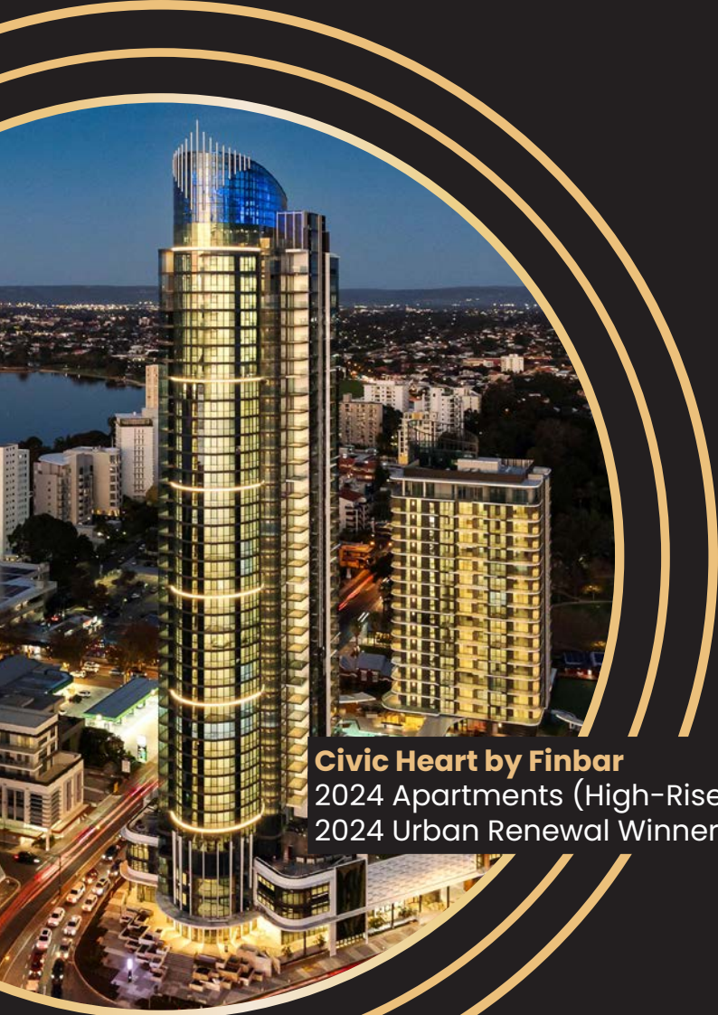
Civic Heart by Finbar 2024 Apartments (High-Rise) Winner 2024 Urban Renewal Winner

When entering multiple categories please ensure the executive summary for each entry is tailored to address the category criteria – this is very important!