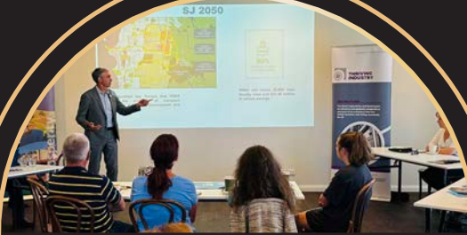
Local Government Authority of the Year Shire of Serpentine Jarrahdale