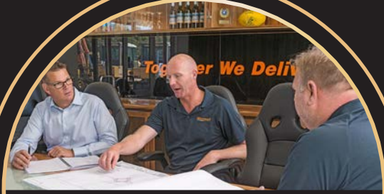
Team of the Year Wormall Group (Joint Winner)