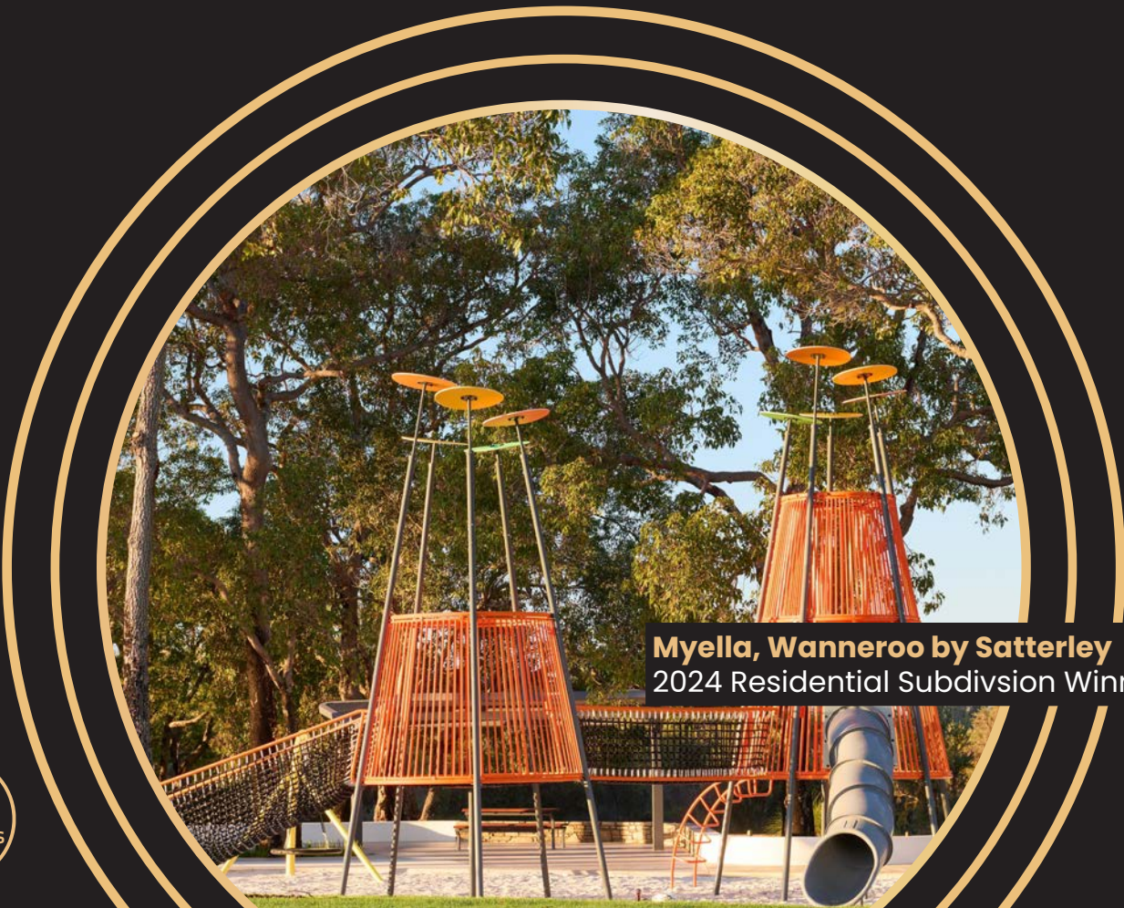
Myella, Wanneroo by Satterley 2024 Residential Subdivision Winner

UDIA WA (08) 9215 3400 events@udiawa.com.au