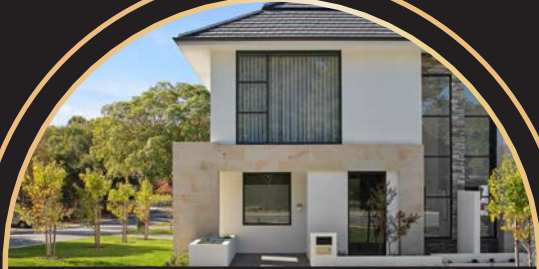
Boutique Development Dalkeith Terraces by Westbridge Urban