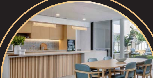
Seniors' Living Cottesloe Redevelopment by Curtin Heritage Living