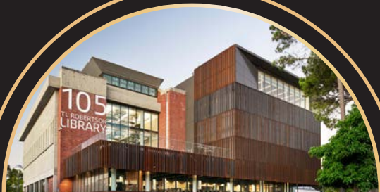
Social & Community Infrastructure TL Robertson Library by Curtin University