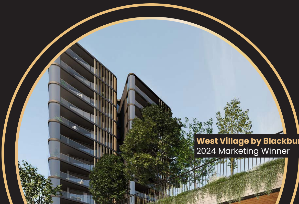
West Village by Blackburne 2024 Marketing Winner