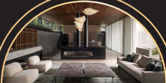
Design The Grove Residences by Blackburne