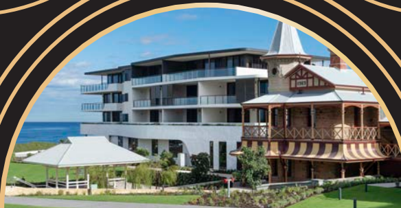
Russel Perry Award for Urban Development Excellence Cottesloe Redevelopment by Curtin Heritage Living