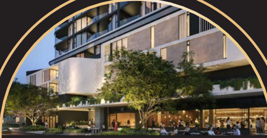
Team of the Year Cirque Duet (Joint Winner)