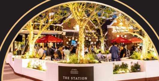
Urban Renewal Civic Heart by Finbar