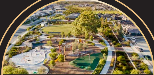
Masterplanned Communities Stockland Whiteman Edge by Stockland