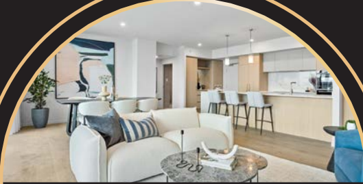
Apartments (High-Rise) Civic Heart by Finbar