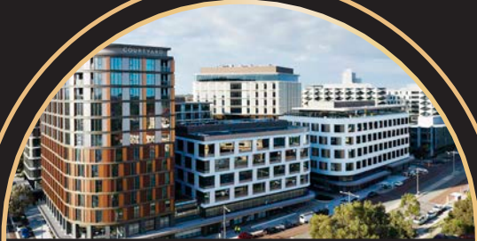
Judges Award Murdoch Square by Hesperia & Aegis Health