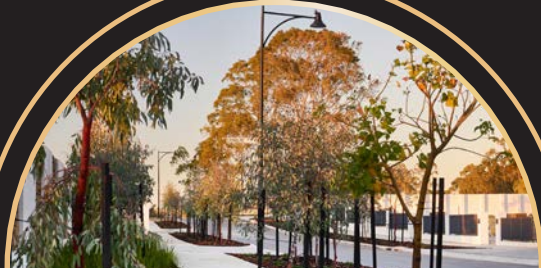
Residential Subdivision Myella, Wanneroo by Satterley