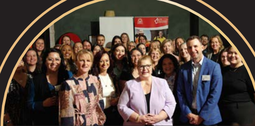
Diversity in Development Construction Training Fund