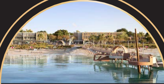
Judges Award Marketing at Kennedy Bay by Parcel Property