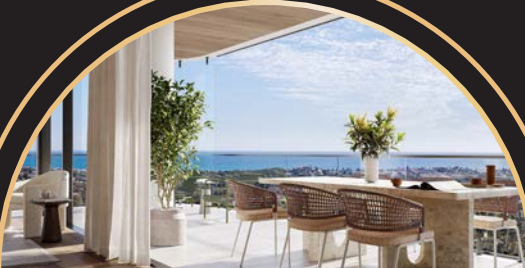
Marketing West Village by Blackburne